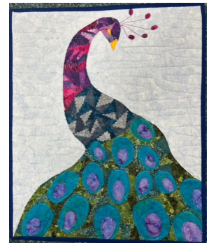
Thursday 10 th April