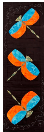
Saturday 25 th January

(Cancellation charges will apply, please see the bottom of the list.)