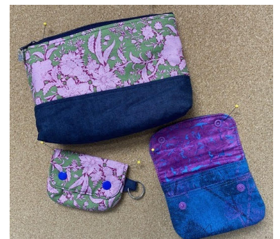
Saturday 12 th April

Pouch and purses with Judith Henshaw . You can never make enough pouches and purses. Take the mystery out of zip insertion with the pouch construction. Add to this a purse for your keys and loose change and a two pocket wallet for notes and cards. All Day 10.00am – 4.00pm.