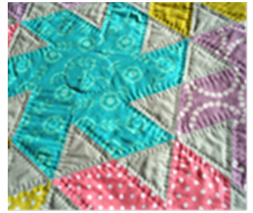
Saturday 22 nd March

Suitable for all levels. All Day 10.00am – 4.00pm.