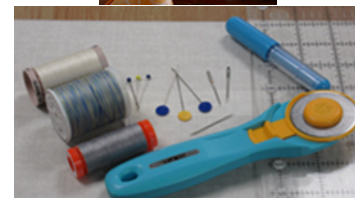
Saturday 1 st March