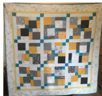
Friday 21 st March