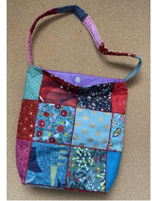
Saturday 29 th March

Couch Patchwork Tote Bag with Judith Henshaw . Do you have a charm pack that you don't know what to do with or a stash of fabric that you can cut into 5" squares? This tote bag could be your answer. You will be using 29 charm squares to make the bag, handles and inside pockets. Add extra decoration by using some wool to couch along the seams. All Day 10.00am – 4.00pm.