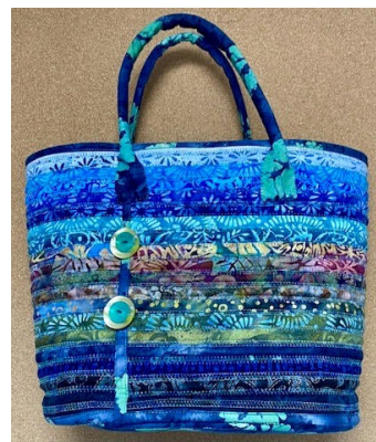
Thursday 20 th & 27 th February

Finished size 58" x 58". Machine sewn. All Day 10.00am - 4.00pm.