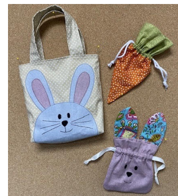
Thursday 13 th March