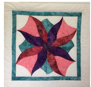
Thursday 13 th February