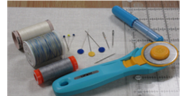
Saturday 19 th October