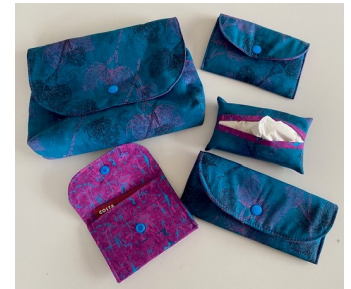
Wednesday 23 rd October