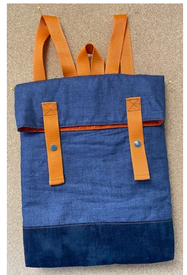
Friday 11 th October