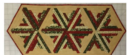
Friday 18 th October