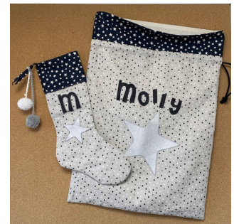
Wednesday 6 th November