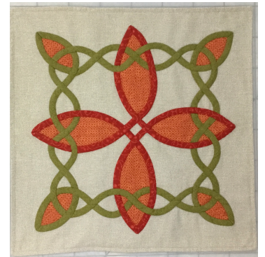
Friday 4 th October

(Cancellation charges will apply, please see the bottom of the list.