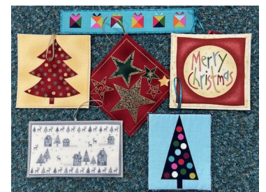
Thursday 7 th November

Sewn Christmas Cards with Alison Forbes. Make your own unique Christmas cards using preprinted fabric panel or make your own design with a variety of shapes. Suitable for all levels. All Day 10.00am - 4.00pm